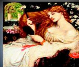
Lilith & Shekinah