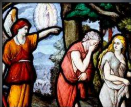
Adam & Eve