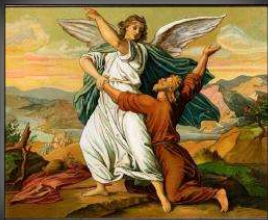
Angel of Death